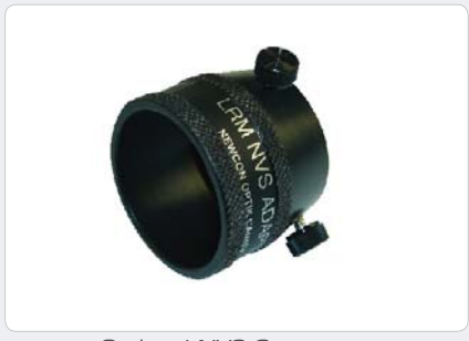
Optional NVS Connector