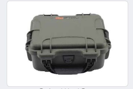
Optional Hard Case