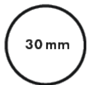
Main tube 30 mm