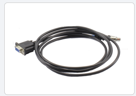
LRF GPS Cable