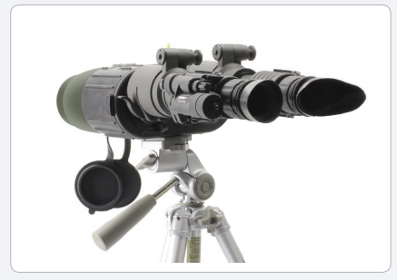
Night Vision Capability