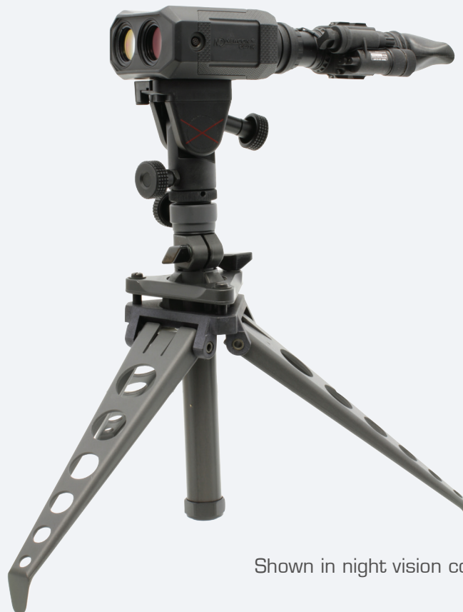
Shown in night vision configuration